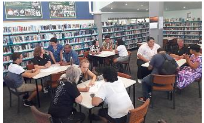
Professional Development in the Library